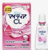
New Mytear® CL-s Ophthalmic Medication