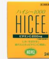
HICEE® 1000 Vitamin Supplement