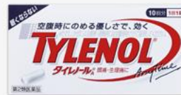
TYLENOL® A Pain Reliever/Fever Reducer