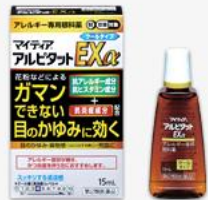
Mytear® ALPITATTO EX α Ophthalmic Medication