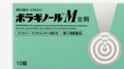
BORRAGINOL® M ZAZAI Anti-hemorrhoid Drug