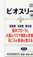
Bio-Three® Hi Tablet Intestinal Regulation Drug