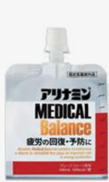
Alinamin® MEDICAL Balance Pouch Type

The product range will remain the same after April 1, 2021.