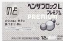
BENZA BLOCK® L PREMIUM Cold Remedy