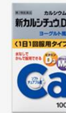
SHIN CALCICHEW® D 3 Calcium Supplement