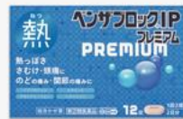
BENZA BLOCK® IP PREMIUM Cold Remedy