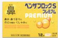
BENZA BLOCK® S PREMIUM Cold Remedy