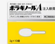
BORRAGINOL® A CHUNYUNANKO Anti-hemorrhoid Drug