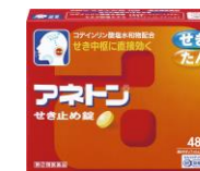
ANETON SEKIDOME JO Cough Medicine