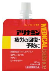
Alinamin Medical Balance Pouch Type