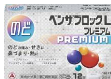
BENZA BLOCK L PREMIUM Cold Remedy