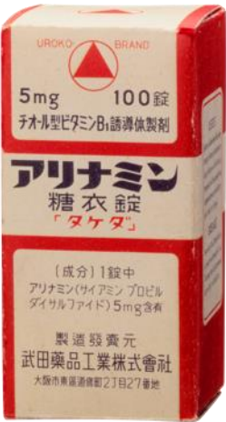
First-generation ALINAMIN sugar-coated tablets *This product is discontinued