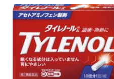
TYLENOL A Pain Reliever/Fever Reducer