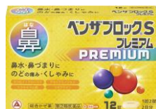
BENZA BLOCK S PREMIUM Cold Remedy