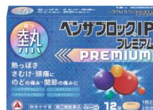
BENZA BLOCK IP PREMIUM Cold Remedy