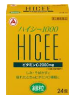
HICEE 1000 Vitamin