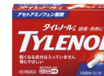
TYLENOL Pain Reliever/Fever Reducer